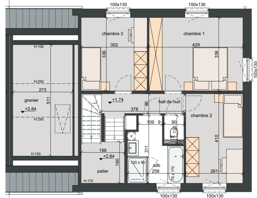
1e étage 1:100